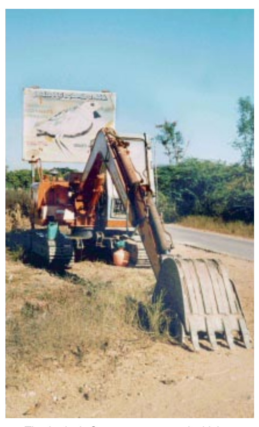
The Jerdon's Courser possesses the highest category of threat for a wild population defined by IUCN — Critically Endangered

"The shocking thing about this Canal construction is that the Telugu-Ganga Canal authorities have not obtained permission for working in the forest from the Andhra Pradesh Forest Department."