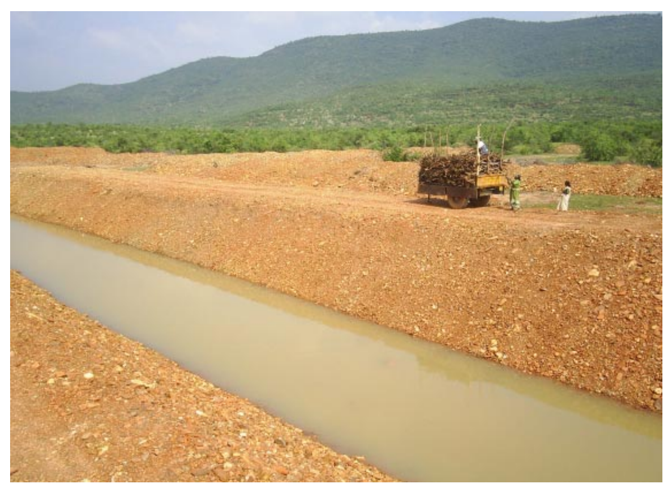
Roads along the Telugu-Ganga Canal would pave way for more illicit woodcutting in and around the Sanctuary area and also facilitate the woodcutters to commute easily

Jerdon's Courser is known to be regularly present.